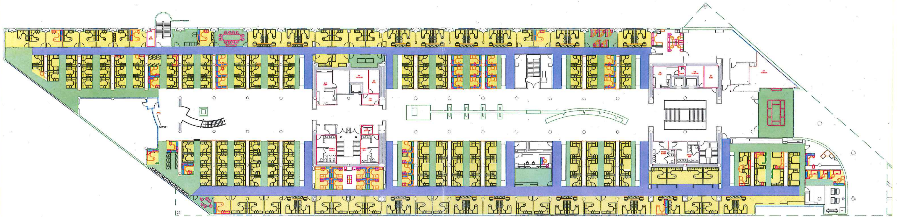
2ND FLOOR - 1,738 sq. ft.